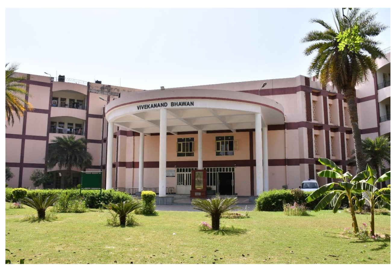
Vivekanand Bhawan (Boys Hostel-IV)