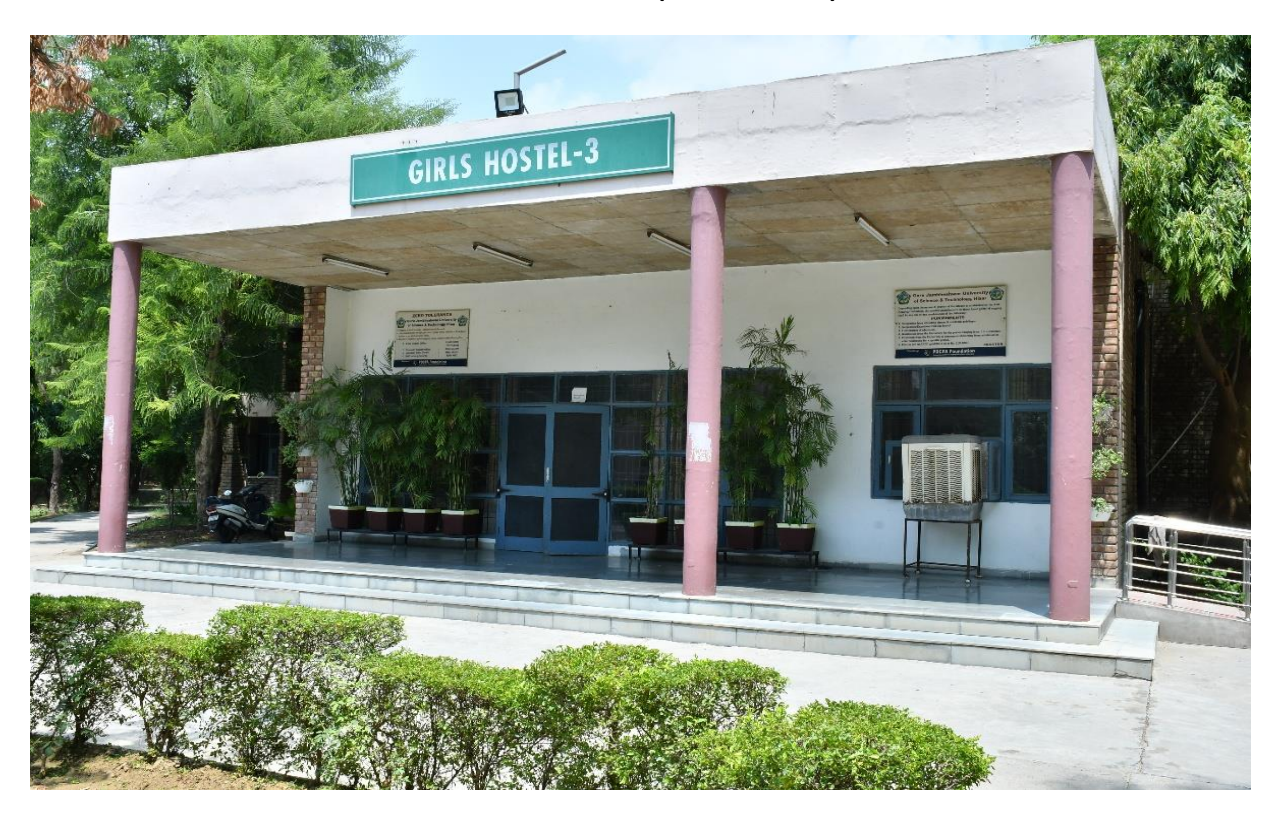
Manikarnika Bhawan (Girls Hostel-III)