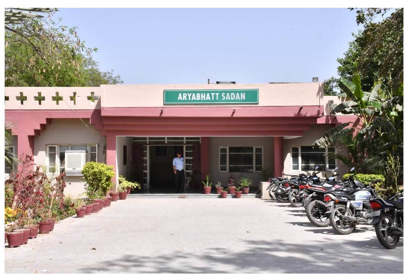
Aryabhatt Sadan (Boys Hostel-II)