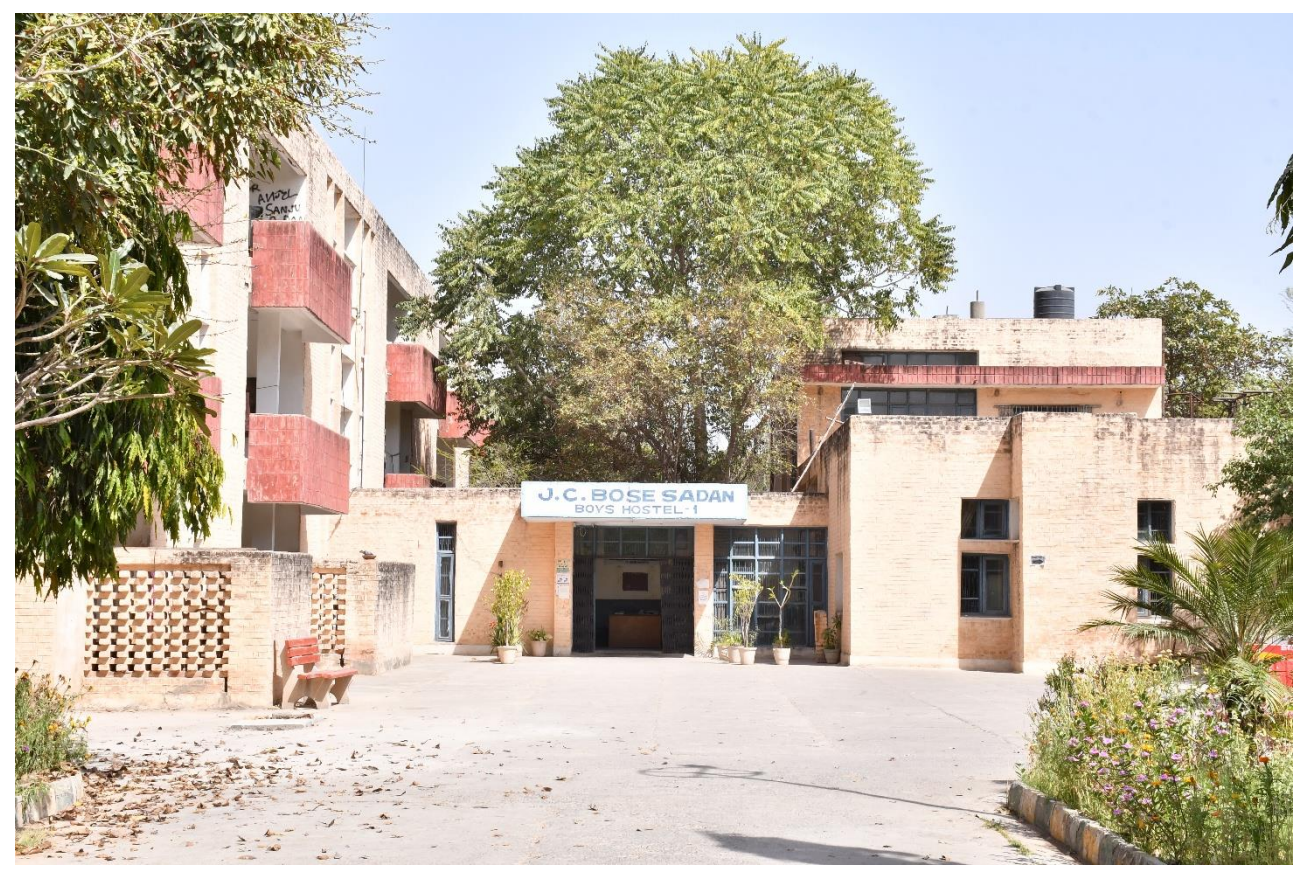
J.C. Bose Sadan (Boys Hostel-I)

The meal is provided as per healthy & balanced menu at reasonable rates and menu items & quality check is done randomly by the Mess Committees, Wardens, Coordinators, Deputy Chief Wardens and the Chief Wardens. Hostel accommodation will be provided according to latest Govt. COVID-19 guidelines and hostel rules. The prospective hostellers are also required to submit medical fitness certificate at the time of admission. The hostel residents are governed by the terms and conditions as contained in the University Hostel Regulations. The university administration with the very energetic and dedicated team of hostel administrations ensures a better quality of life for all the hostel residents.