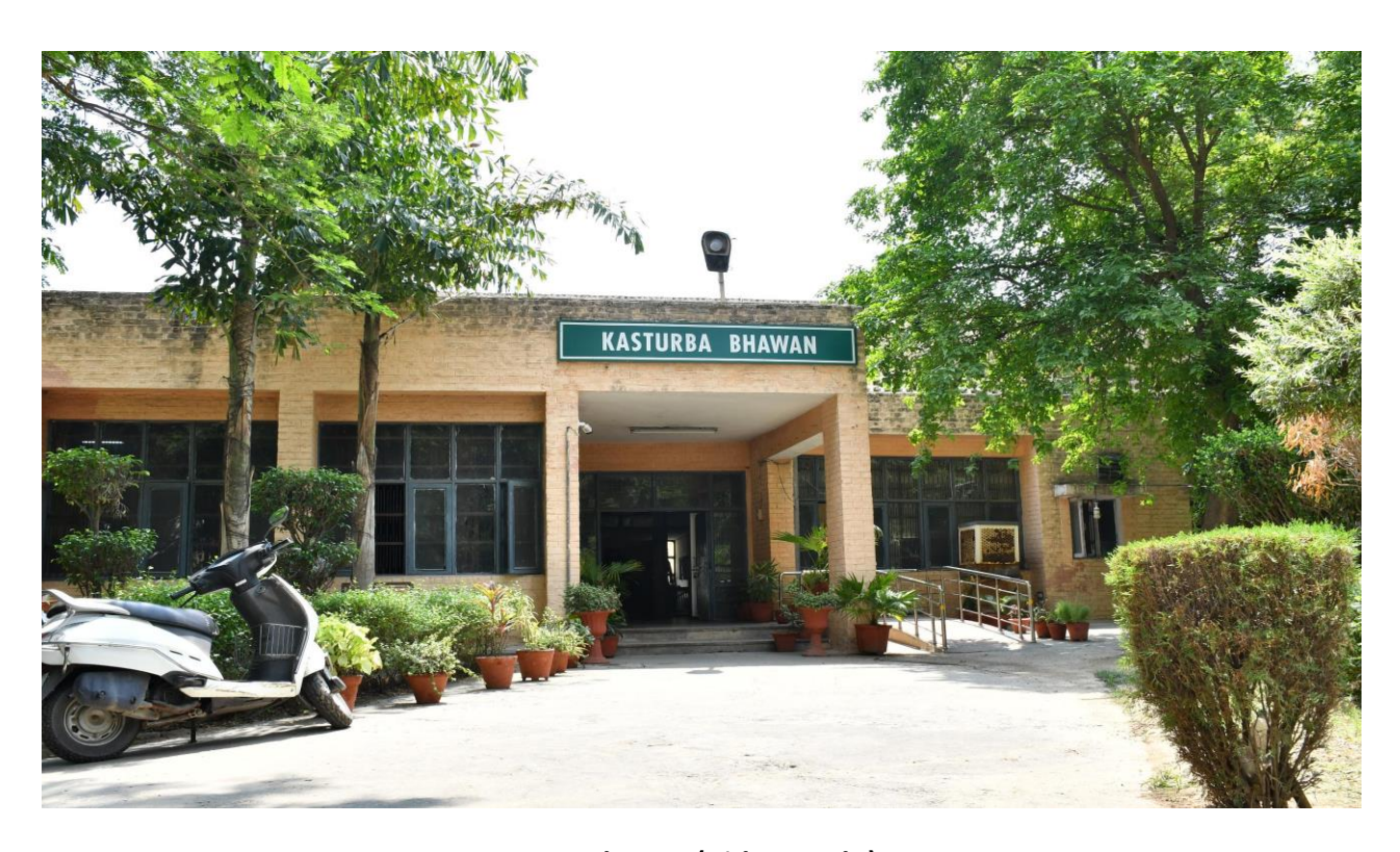
KASTURBA Bhawan (Girls Hostel-I)