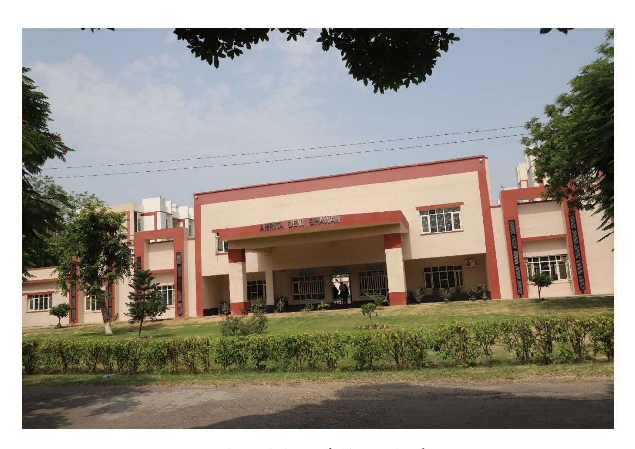
Amrita Devi Bhawan (Girls Hostel –IV)