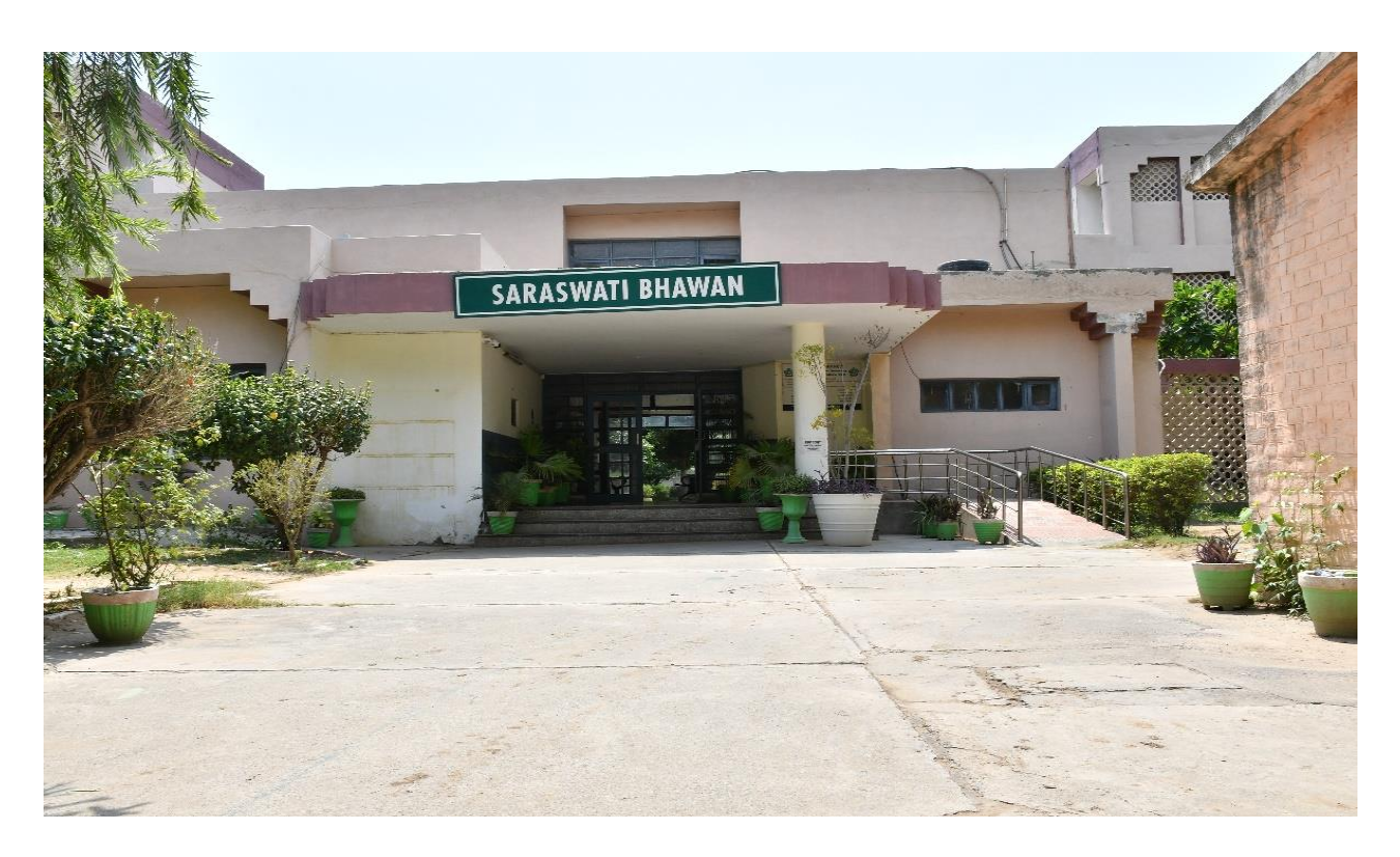
Saraswati Bhawan (Girls Hostel-II)